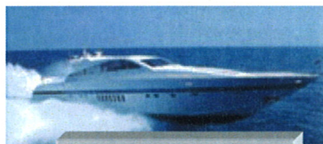
Leopard 27 M